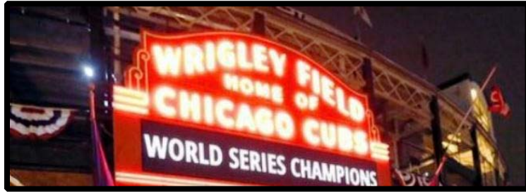
No one thought this could ever happen

1960. Loveable losers no more, they became World Champions and my 42 year wait as a fan was finally over.