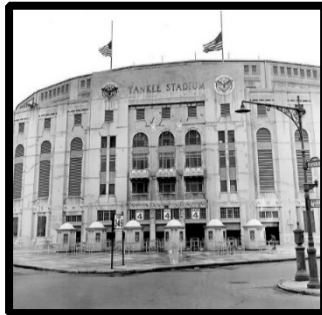
Old Yankee Stadium Street view

At Yankee stadium, they also have a somewhat annoying tradition of playing a whistle sound after each opponent strikeout. One electronics company, who is a sponsor, uses this whistle as their company jingle.