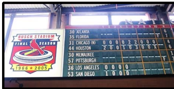
Concourse area scoreboard