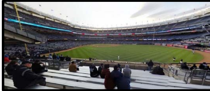
The view from Section 203